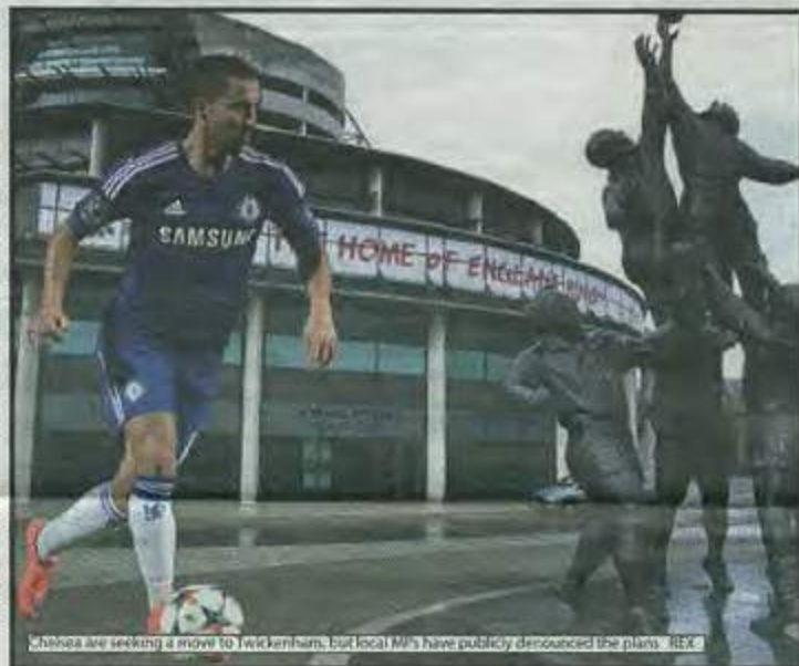
Chelsea are seeking a move to Twickenham, but local MPs have publicly denounced the plans.