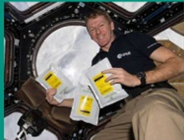
Tim Peake on the ISS with the seeds

2kg of seeds had travelled to space on the Soyuz 44S rocket in September 2015. They had been stored in microgravity for six months, returning to earth with astronaut Scott Kelly in March 2016. Our mission was to grow the two packets of seeds without knowing which ones had been in space and report our findings back to the RHS.