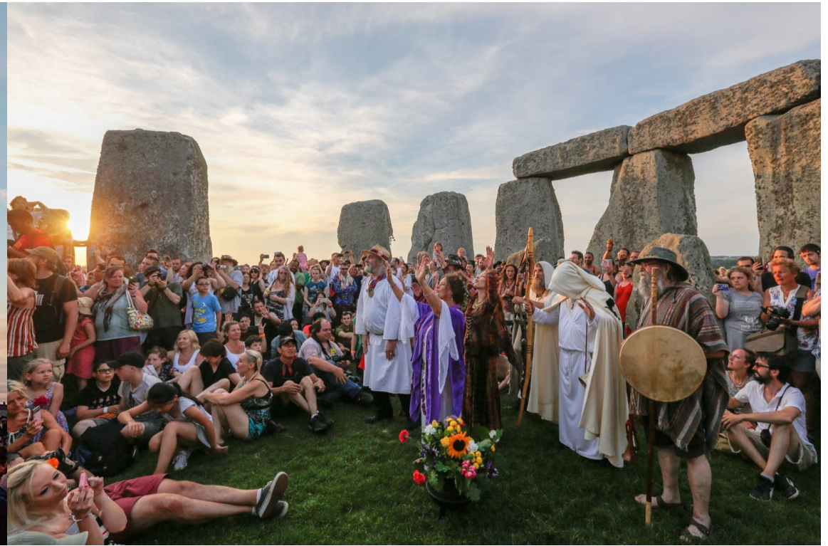
The Winter Solstice